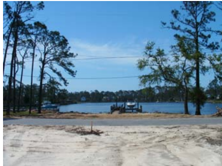
View from lot 1 towards lot 2