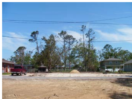
View from lot 2 towards lot 1